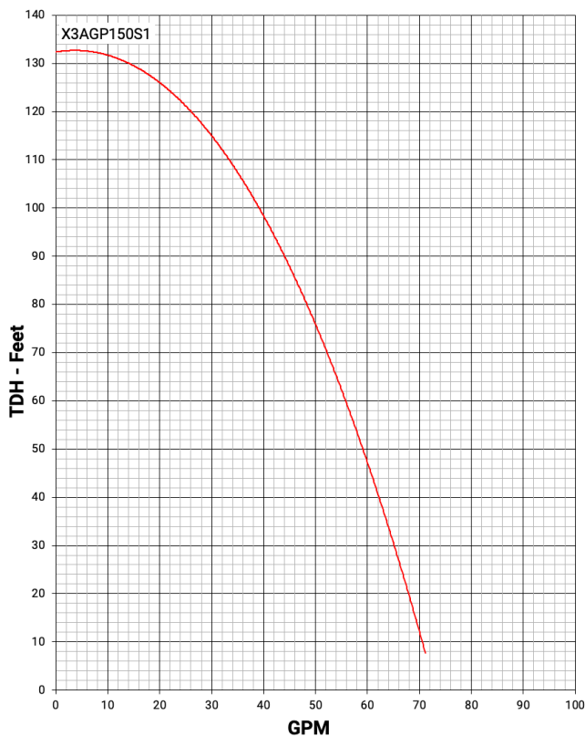
Performance @ 230V; SG = 0.78