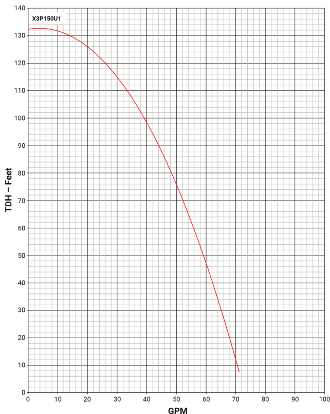
Performance @ 230V; SG=0.78