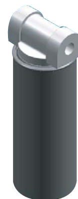
260 w/50003 Adaptor