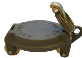
305C (2'') standard handle