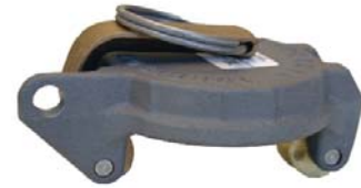
305C (2'') low profile handle