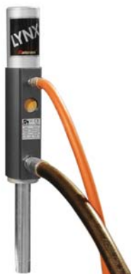
Pump & Hose Package - Stub 1111-017