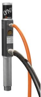
Pump & Hose Package - Stub 1111-010