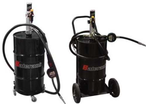
16 Gal. Drum Package Dolly 1111-019 16 Gal. Drum Package Cart 1111-022