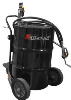
55 Gal. Drum Package - Cart 1111-014