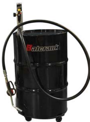
55 Gal. Drum Package - Dolly 1111-012