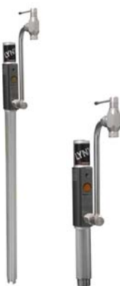
Pump & Spigot Package - Drum 1111-009 Pump & Spigot Package - Stub 1111-025