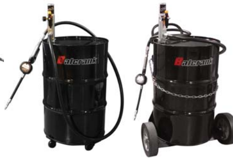
55 Gal. Drum Package Dolly 1111-007 55 Gal. Drum Package Cart 1111-008