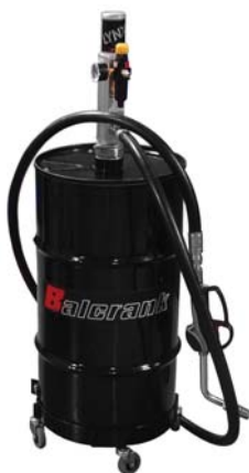
16 Gal. Drum Package - Dolly 1111-013