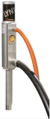
Pump & Hose Package - Stub 1111-015