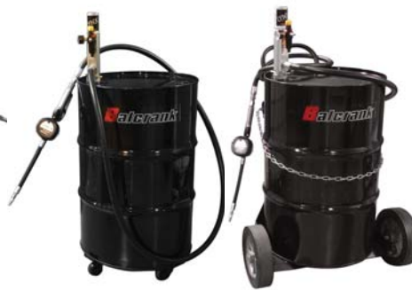
55 Gal. Drum Package Dolly 1111-020 55 Gal. Drum Package Cart 1111-023