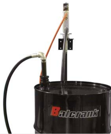
Pump & Wall Mount Package - Stub 1111-016