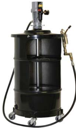
Portable Pump Packages - 120 lb. 1151-028