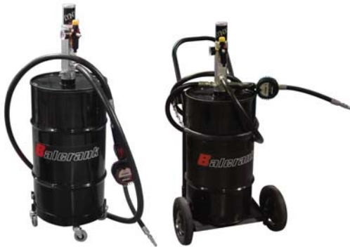
16 Gal. Drum Package Dolly 1111-005 16 Gal. Drum Package Cart 1111-006