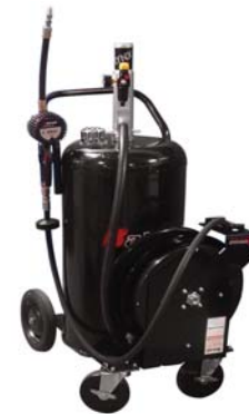
24 Gallon Package 1111-021