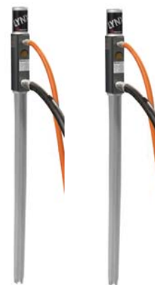
1:1 Pump & Hose Package Drum 1111-011 2:1 SS Pump & Hose Package Drum 1161-003