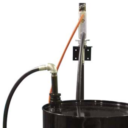
Pump & Wall Mount Package - Stub 1111-018