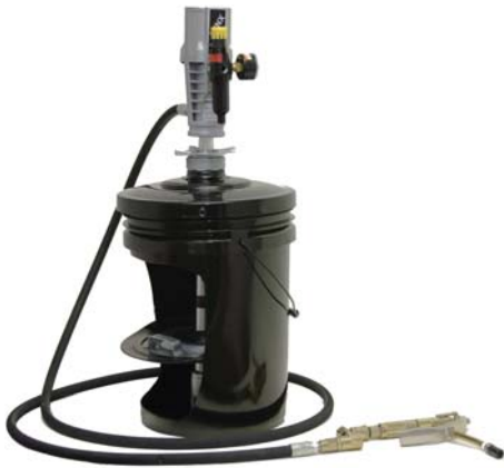
Portable Pump Packages - 25-35 lb. 1151-027