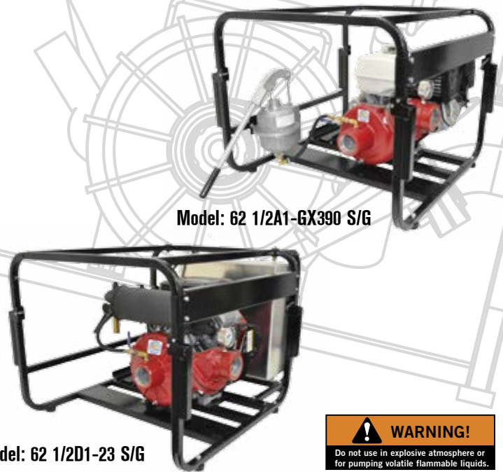
Model: 62 1/2A1-GX390 S/G

*Model 62 1/2D1-CH23 S/G comes standard with a portable 6 gallon fuel tank with a 6' fuel line and primer bulb.