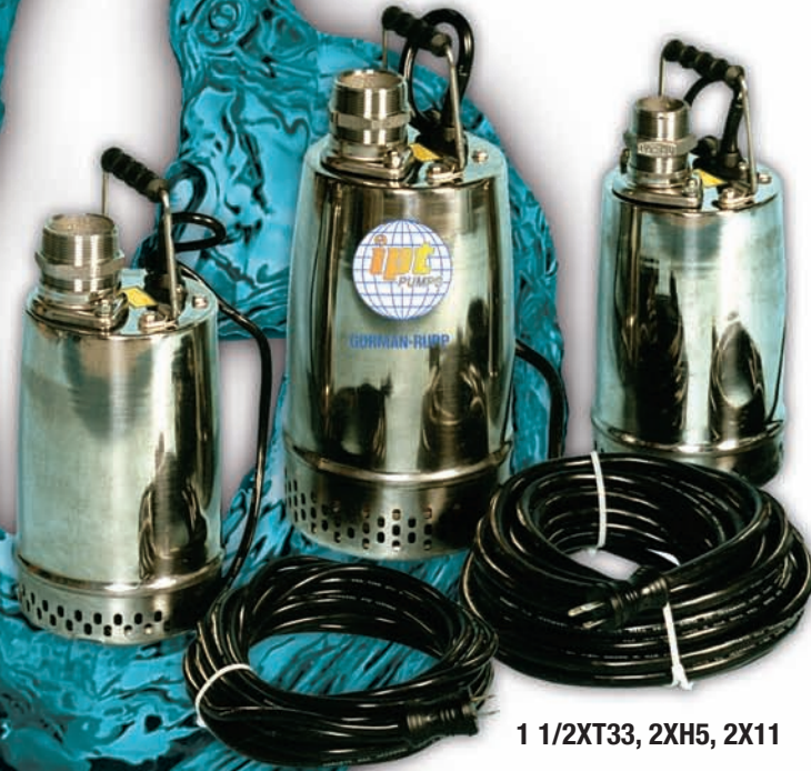
1 1/2XT33, 2XH5, 2X11