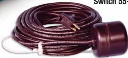
Optional Piggyback Float Switch 55-930

Slim-design, light weight CSA listed submersibles feature top discharge as well as cast-iron impellers, 304 stainless steel casing, motor housing, shaft and hardware. Pump motor is thermal overload protected. An optional piggyback mercury-free float switch is available. Float Switches: The mercury free liquid level control has a piggyback plug molded to the cord allowing the pump motor to plug into the cord and then plug the entire assembly into a standard grounded outlet.