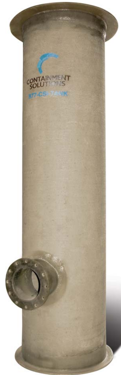
36" x 12' Vertical Pump Vault