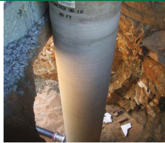
36"x 20' vault connected to a 30,000 gallon Flowtite Fire Protection Tank.