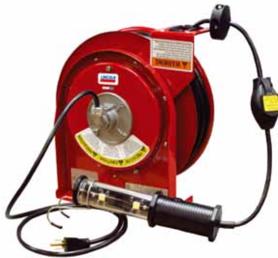
Model shown: 91035