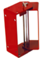
Model 278558 - wall-mounted swing bracket (optional)