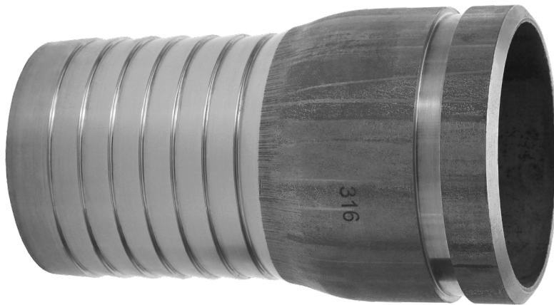
316 SS - GROOVED