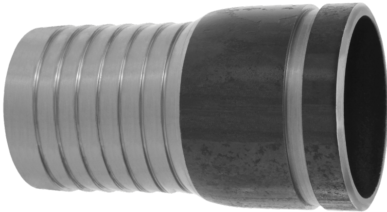
STEEL - GROOVED