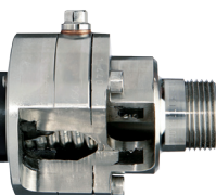
End fitting with NPT thread

Next time you have to snake around a gas station, think about all the advantages that SECON-X offers. We think you'll be highly tempted.