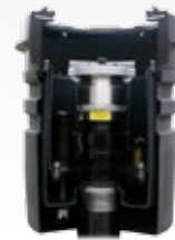
Variable Height Adjustable