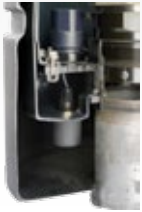
Electronic Liquid Detection Sensor Option

Defender Series™ five gallon spill containers combine years of knowledge and experience in forecourts across the globe to represent the next generation in spill containment. The Defender Series™ adapts alongside evolving environmental regulations with the latest innovations in spill containment. Get the best defense and quality construction with the Defender Series™.