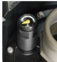
I2 Interstitial Integrity Monitor Mechanical Liquid Detection Sensor