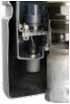
Electronic Liquid Detection Sensor Option

Defender Series™ five gallon spill containers combine years of knowledge and experience in forecourts across the globe to represent the next generation in spill containment. The Defender Series™ adapts alongside evolving environmental regulations with the latest innovations in spill containment. Get the best defense and quality construction with the Defender Series™.