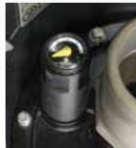
I2 Interstitial Integrity Monitor Mechanical Liquid Detection Sensor