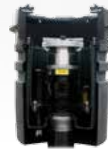
Variable Height Adjustable