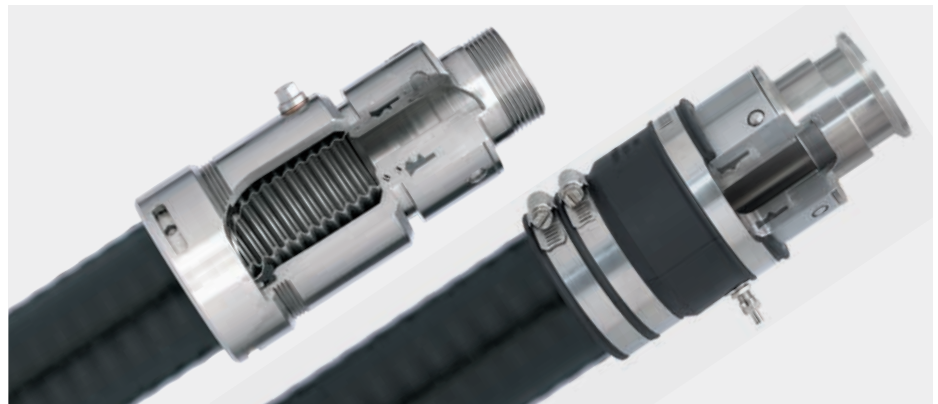
Closed end fitting, open end fitting – available in NPT or EZ-Fit

FLEXWELL®-HL is a flexible pipe system made of corrugated 316L (1.4404) stainless steel primary and secondary pipes for operating pressures of up to 145 PSIG (10 bar). The interstitial space between primary and secondary pipe can be used for leak detection. The pipe is corrosion protected by a polyethylene jacket. The stainless steel pipe provides an enduring, impermeable barrier, even with future new fuels or fuel combinations.