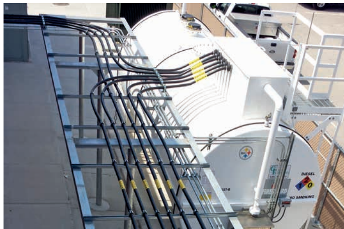
NEW: UL 1369 Above Ground Certified