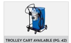
TROLLEY CART AVAILABLE (PG. 42)