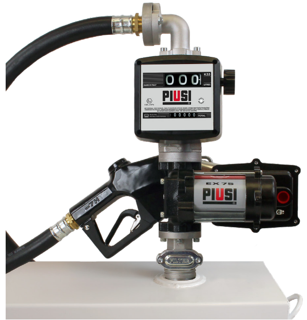
EX75 PRO KIT - AUTO NOZZLE + K33 METER