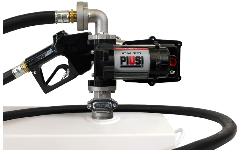
EX75 BASIC KIT - AUTO NOZZLE