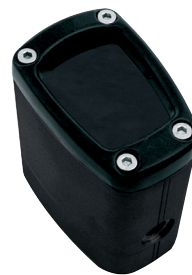
K200 HP PULSER