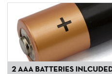
2 AAA BATTERIES INCLUDED