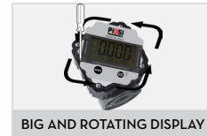
BIG AND ROTATING DISPLAY