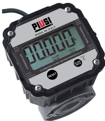
K600 B/3 WITH PULSE-OUT