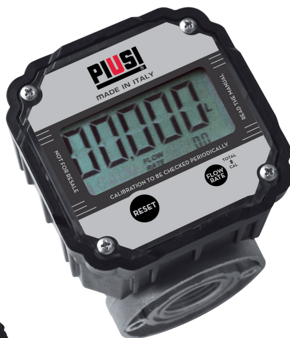
K600 B/3 METER