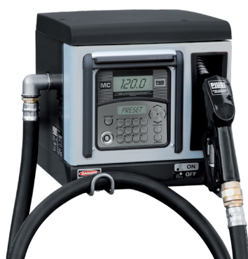
CUBE 70 MC