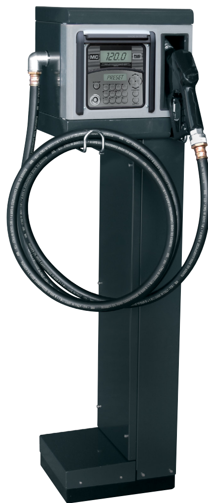
CUBE 70 MC WITH PEDESTAL (optional)