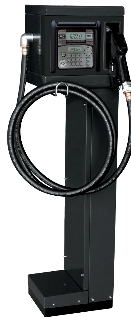
CUBE MC 2.0 WITH PEDESTAL (optional)