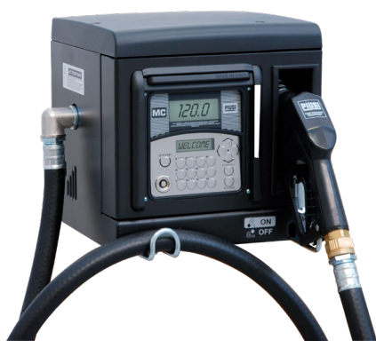
CUBE MC 2.0