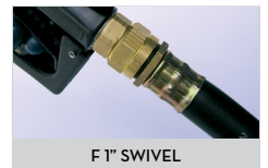
F 1" SWIVEL