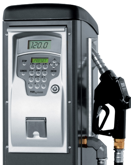
INTEGRATED TICKET PRINTER