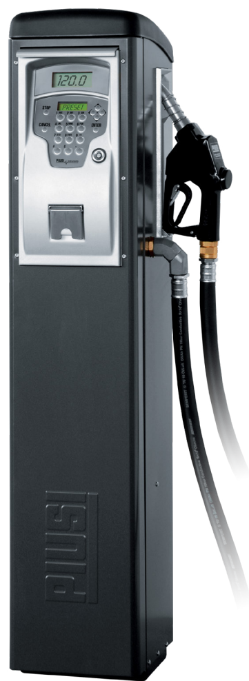
SELF SERVICE FM