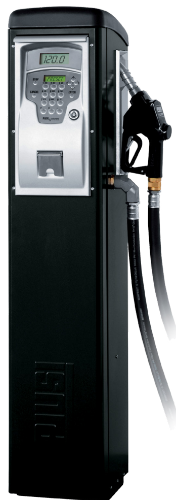
SELF SERVICE FM 2.0