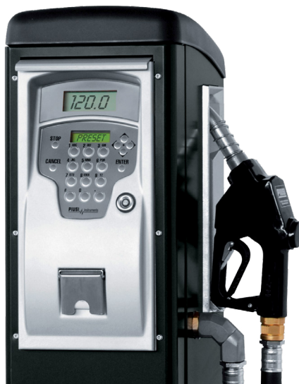
INTEGRATED TICKET PRINTER