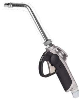
with rigid spout