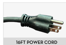
16FT POWER CORD