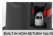
BUILT-IN NON RETURN VALVE