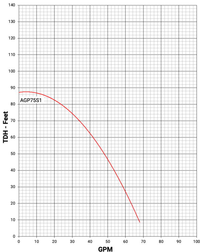
Performance @ 230V; SG = 0.78