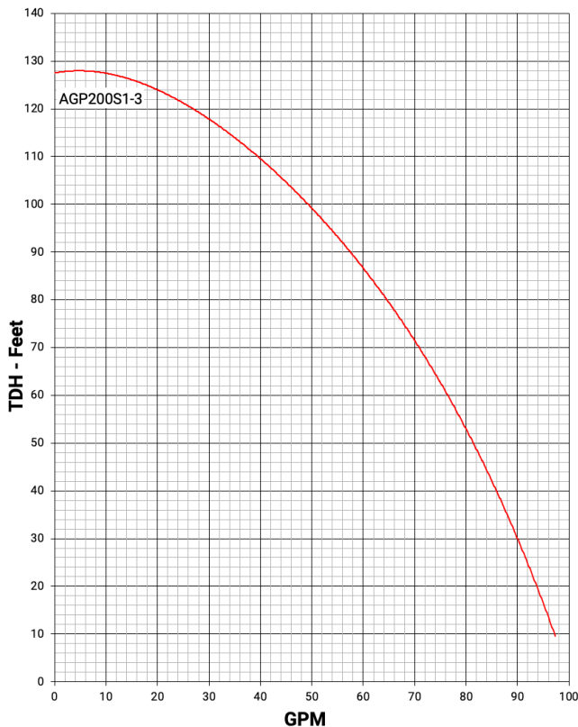
Performance @ 230V; SG = 0.78